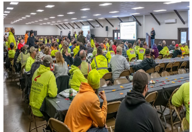
▲ Schlouch hosted its 42nd annual company meeting, providing the opportunity to share a meal, connect as a team, and receive updates on company results and the future.