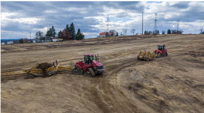
▲ Schlouch crews make quality progress with earthwork on site at High Meadows Estates project.

Schlouch Incorporated has been selected by OHI-HM Holdings, LP to prepare the 136.61-acre site for the High Meadow Estates residential development in Allen Township. The project will feature 59 single-family homes. Schlouch's work includes earthwork, installation of drainage systems, sanitary and storm sewers, erosion and sediment control measures, grading for water runoff, pad preparation, curbing, and paving. Completion is anticipated in summer 2026.