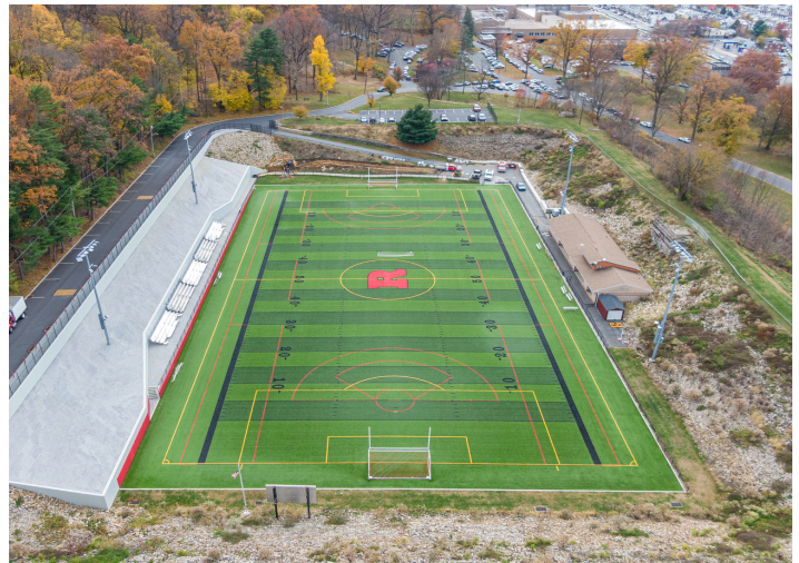
▲ Reading High School Reservoir Athletic Field.

Schlouch Incorporated was selected by the Reading School District to complete field improvements at the Reading School District Reservoir Field, located in Hampden Park in the City of Reading. The project included the removal and replacement of the artificial turf playing surface, the installation of cast-in-place concrete walls to enhance slope stabilization and provide spectator seating, and a series of accessibility upgrades throughout the venue. Work was completed in fall 2024.