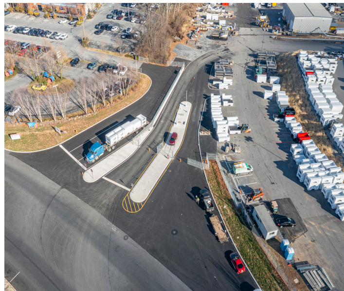
▲ Reading Truck Body Driveway Relocation project.