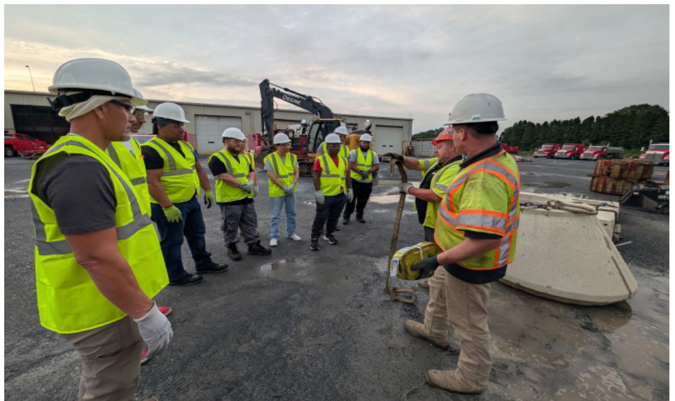
▲ Schlouch safety trainers deliver a material handling and rigging course to Tec Centro Preconstruction students, sharing hands-on training and insight into safety best practices as part of our workforce outreach efforts.

At Schlouch Inc., we're not just building infrastructure. We're building great people.