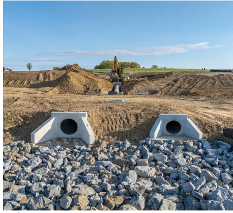
▲ Schlouch pipe crew safely installs storm pipe at Greenleaf Fields at Parkland project in Lehigh County.

Schlouch Incorporated has been selected by Greenleaf Fields at Parkland to prepare the 107.10-acre site for a new residential community located off Greenleaf Road in Schnecksville, North Whitehall Township. The development, led by Tuskes Homes, will feature 46 single-family homes. Schlouch's scope of work includes basin construction, road earthwork, erosion and sediment control, lot grading, storm sewer installation, and paving. The project is scheduled for completion in fall 2025.