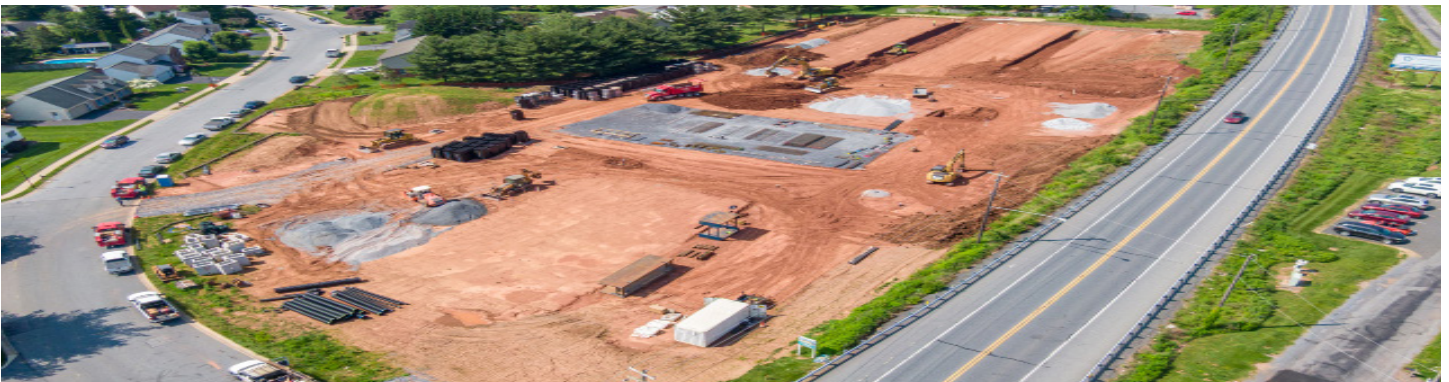
▲ Bird's eye view of our work in progress at Forino's future new office location in Lancaster County. Congratulations to the Forino family on 50 years of business!