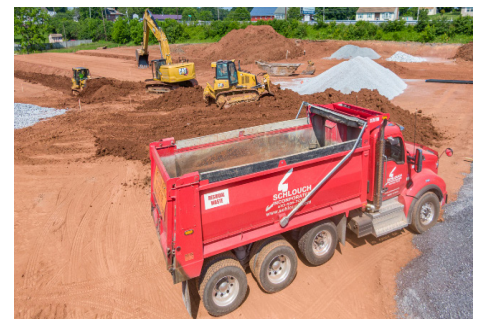
▲ Schlouch crew safely excavates for underground detention basin at Forino office project in Lancaster County.