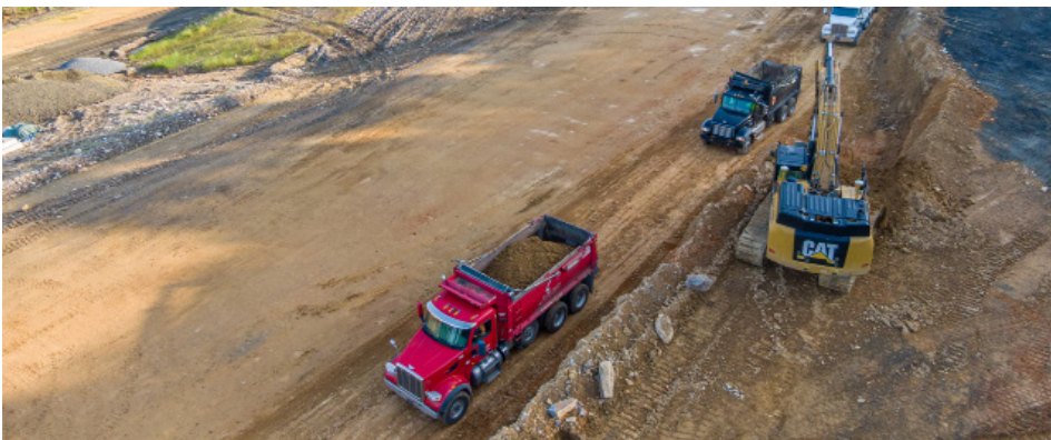
▲ Schlouch crews continue to provide safe excavation and hauling at Rowe Tract project in Berks County.