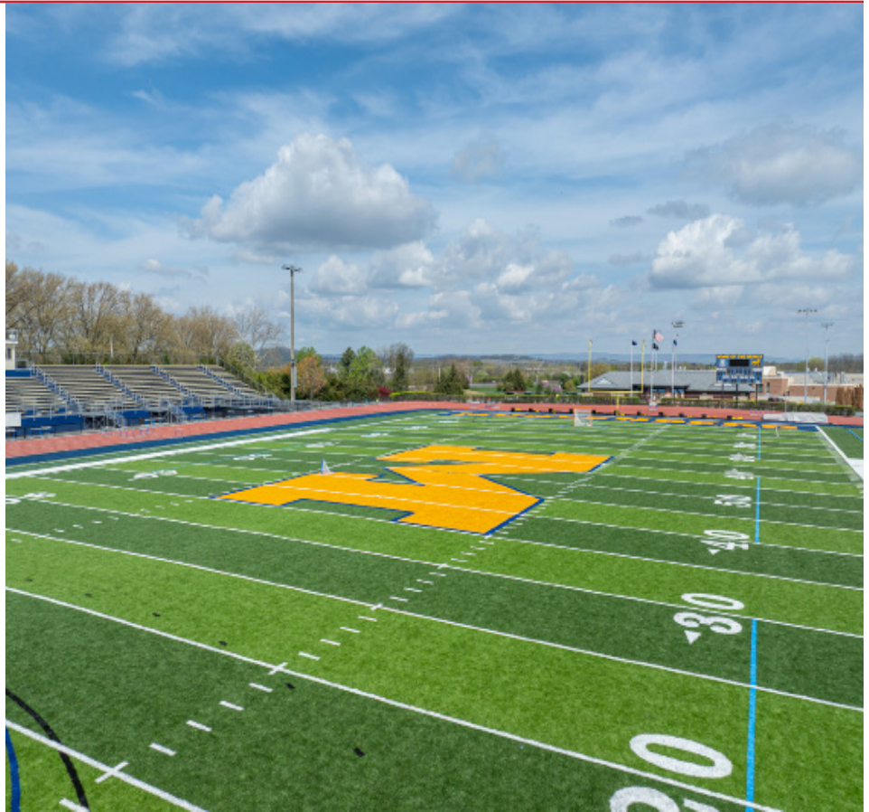
▲ Schlouch is thrilled to see the vision come to life at Muhlenberg High School in Berks County! We're grateful for the opportunity to work alongside Muhlenberg School District to build a versatile turf field that will benefit students, athletes, and the community for years to come.

Schlouch Incorporated has been selected by Metropolitan 10, LLC to perform site preparation for the Rowe Tract, a new multi-family residential development located off Old Pricetown Road in Alsace Township. The 37.167-acre project will feature five (5) 36-unit buildings and one (1) 12-unit building. Schlouch's responsibilities include earthwork, installation of drainage systems, sanitary and storm sewers, water lines, concrete curbing, and asphalt paving. The project is slated for completion in spring 2026.