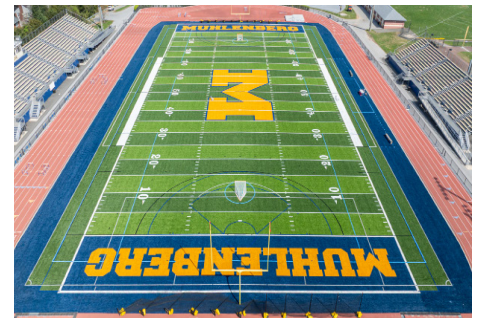
▲ Schlouch was proud to partner with Muhlenberg School District, in Berks County, to bring this new turf athletic field to life! Honored to team up and deliver a project where students, athletes, and the community can thrive for years to come!

(Muhlenberg School District project continued on page 3)