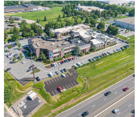
▲ Schlouch crews safely completed the parking lot expansion for Lehigh Valley Health Network at 2300 Highland Avenue project in Northampton County.

Schlouch Incorporated was selected by Lehigh Valley Health Network to prepare the 7.27-acre site for parking lot improvements at 2300 Highland Avenue, located at Highland Road and Township Line Road in Bethlehem Township. Schlouch's scope included earthwork, drainage systems, storm sewer installation, concrete curbs, asphalt paving, and site lighting. The project was completed in spring 2025.