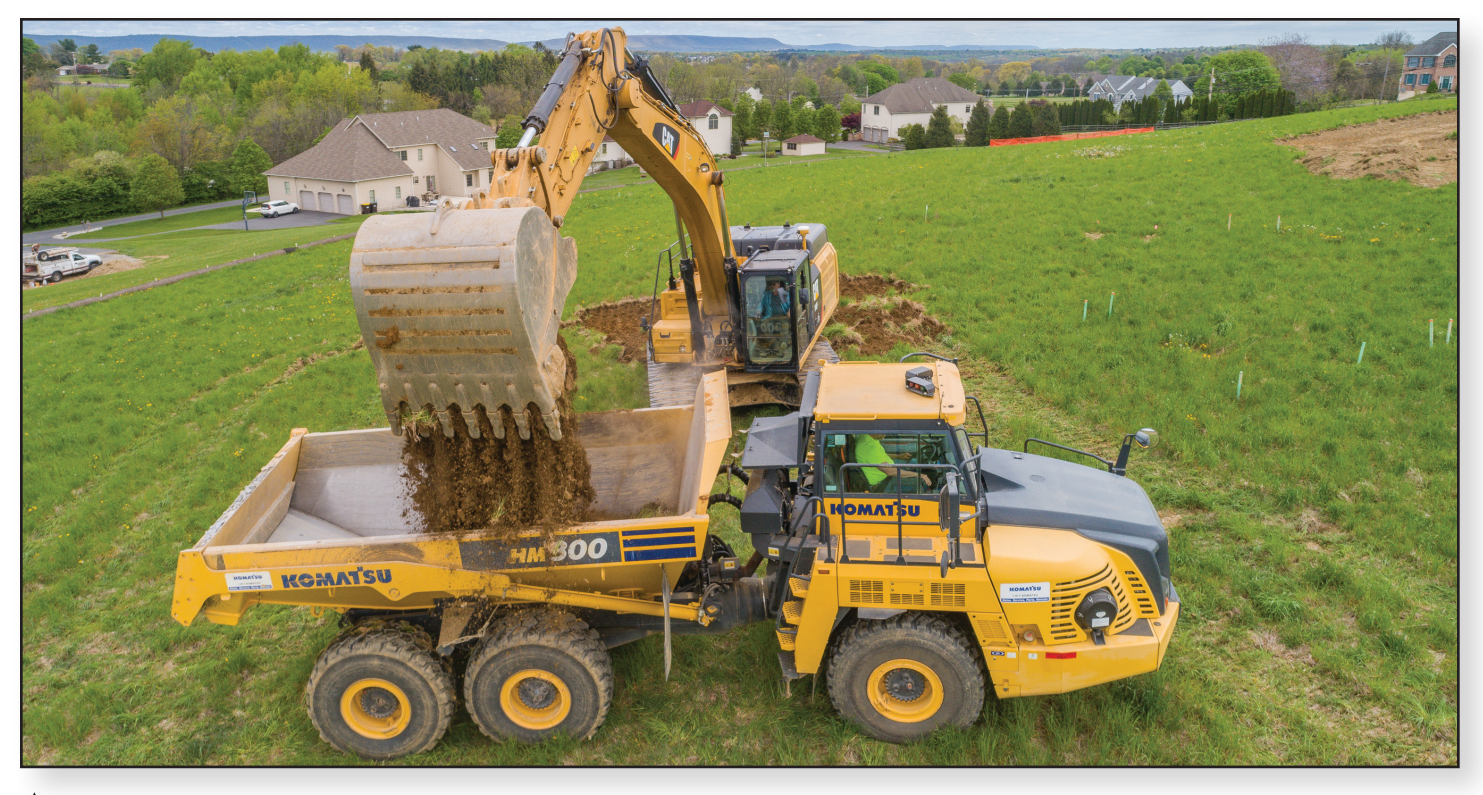
At High Street Estates, Schlouch strips topsoil for the 13-lot single-family residential development.