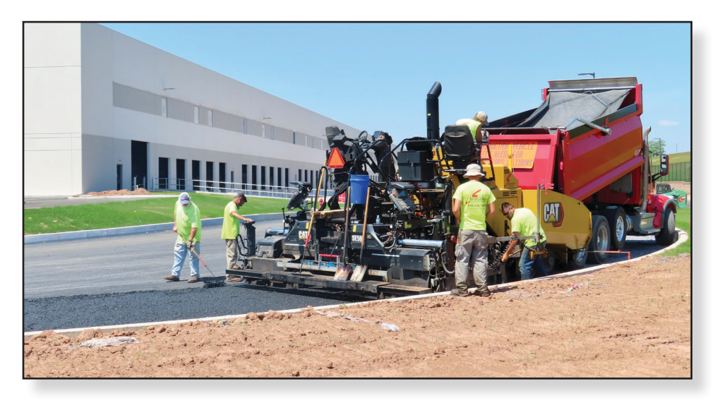
A Schlouch paving crew makes quality progress on two warehouses at the "First Logistics Center @ 283" site, located in Dauphin County, PA.