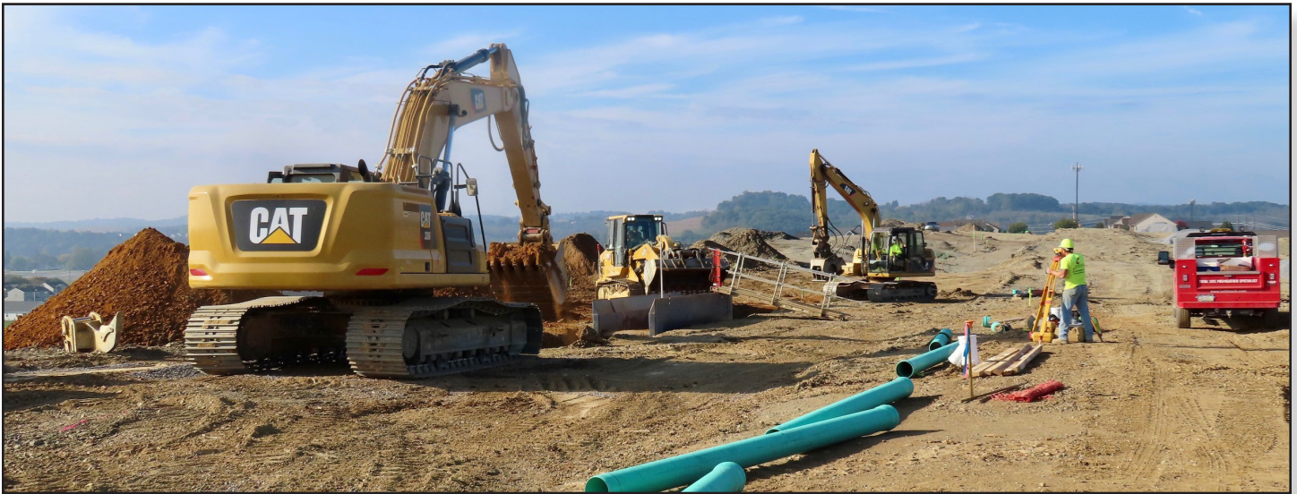
▲ Schlouch utility crews install sanitary sewer for 150 single family and semi-detached dwellings at the “McIntosh Farms” site, located in Ontelaunee Township, Berks County, PA.

Schlouch Incorporated’s dedication to helping its clients succeed through meeting deadlines, budgets, and business objectives in a safe, professional manner continues to be a focal point in 2021.