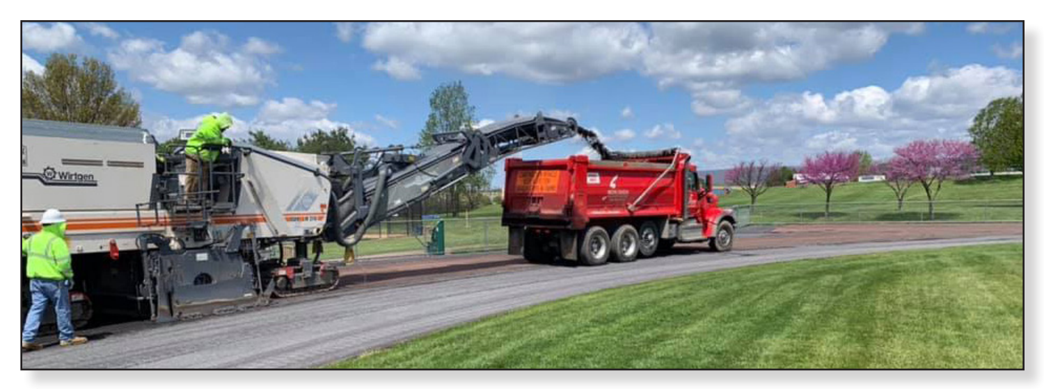
▲ Schlouch completes milling and paving for the new track at Northern Lebanon High School, Lebanon County, PA.