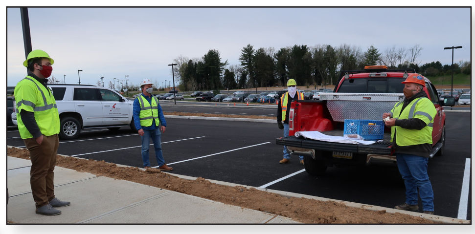
▲ Schlouch employees exhibit social distancing during a morning huddle.

Due to the shutdown of construction in PA, we were operating at only 40% of full capacity on health care and essential projects where we received waivers until construction was re-opened on May 1st.